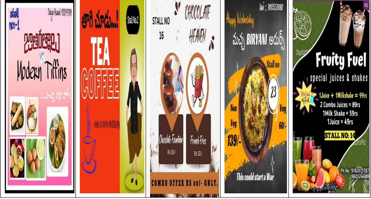
Brochures of Food Stalls By the Students of MBA Department