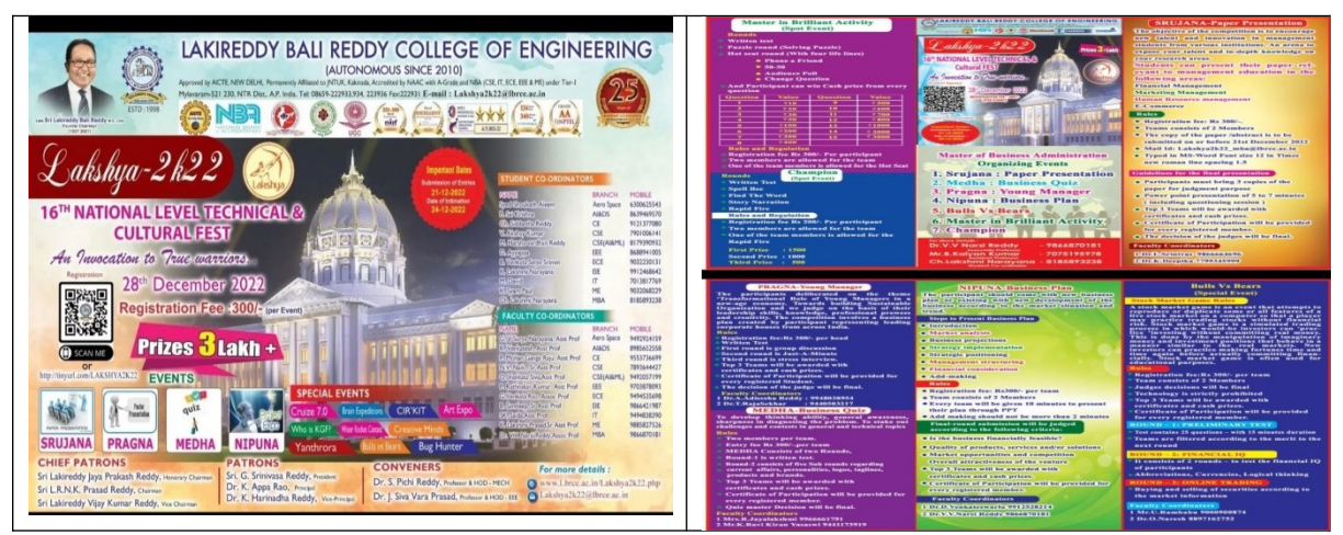
College Brochure and Department Brochure