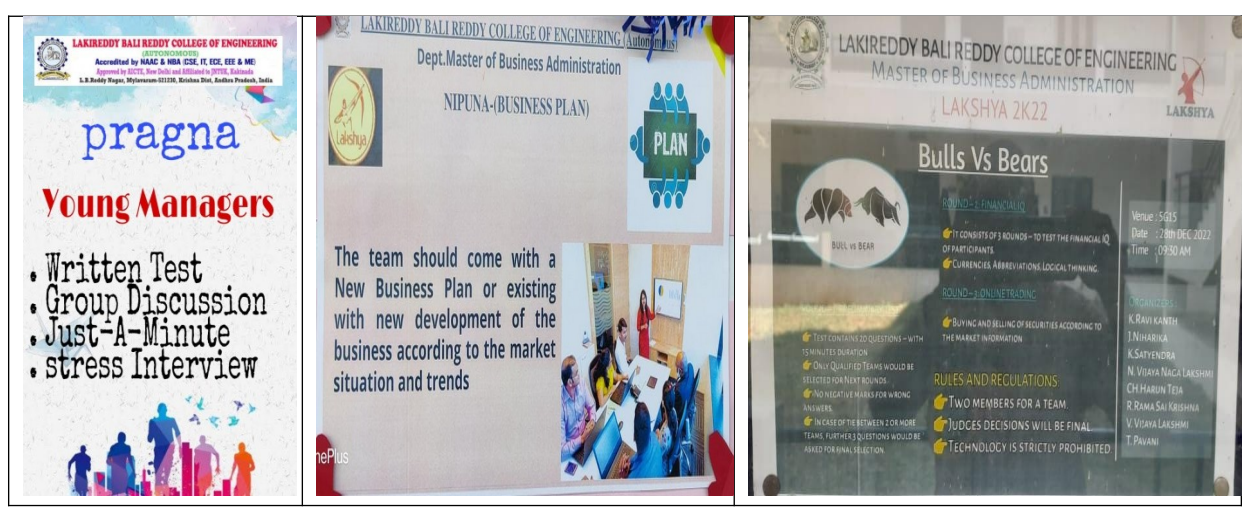
Brochures of Different Events